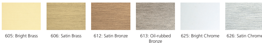
605: Bright Brass 606: Satin Brass 612: Satin Bronze 613: Oil-rubbed Bronze 625: Bright Chrome 626: Satin Chrome